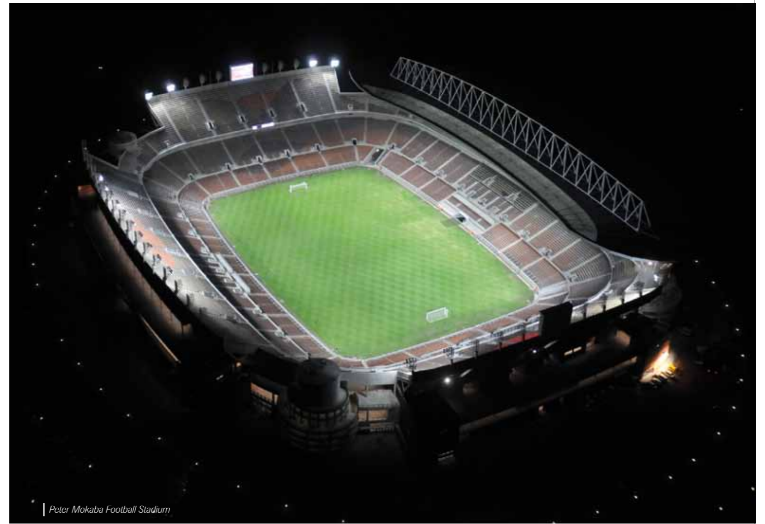
Peter Mokaba Football Stadium