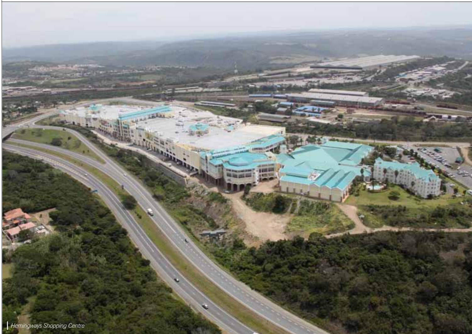
Hemingways Shopping Centre