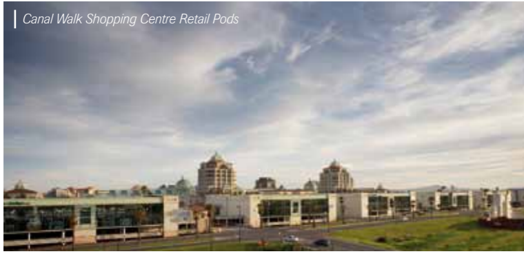
Canal Walk Shopping Centre Retail Pods