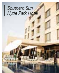
Southern Sun Hyde Park Hotel